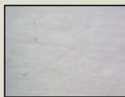
IGV Servo Pencil filter - After OILKLEEN